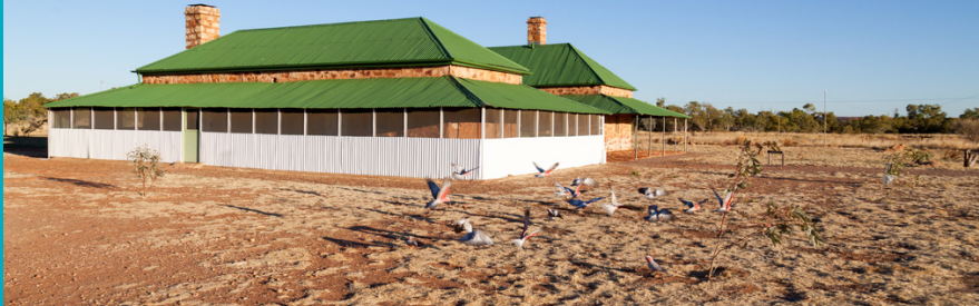
Tennant Creek Telegraph Station

Drop into one of the local bakeries or cafés for breakfast before making your way to the Tennant Creek Telegraph Station. The historic building played a significant role in the late 1800's when the Overland Telegraph Line was being constructed, and provided a refuge for linesman and travellers alike from the harsh surrounds. If you want to explore inside the historic buildings make sure you ask for the key from the Battery Hill Mining Centre.