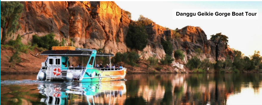
Danggu Geikie Gorge Boat Tour

Just 20 kilometres north of town lies Geikie Gorge National Park. Join the local Bunuba people for an insightful river cruise and cultural tour, exploring the 30-metre deep gorge, fossilised ancient lifeforms and native wildlife, including freshwater crocs.