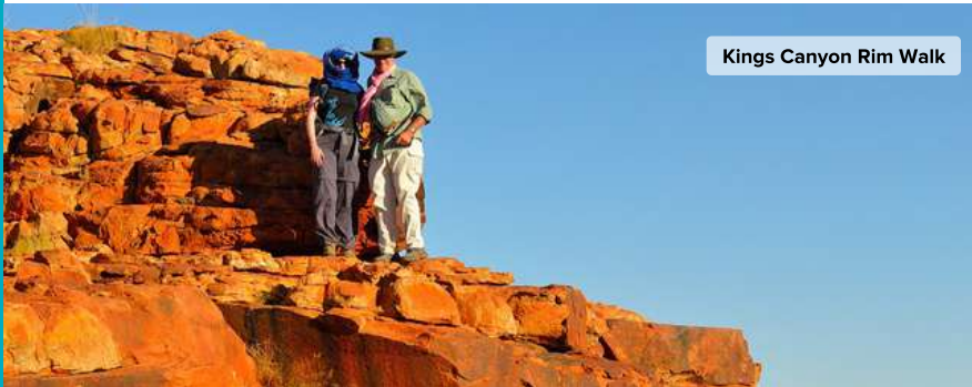
Kings Canyon Rim Walk

Rise early to embark on the Kings Canyon Rim Walk, a 6.4-kilometre trail with awe-inspiring views of the sheer sandstone cliffs, palm-filled crevices, valley floor and desert. The walk begins with a steep ascent, then follows the canyon's cliff face before descending to the Garden of Eden waterhole and the weathered rock domes of the Lost City. For those looking for a more relaxed option, the 2.6-kilometre Kings Creek Walk provides equally breathtaking views.