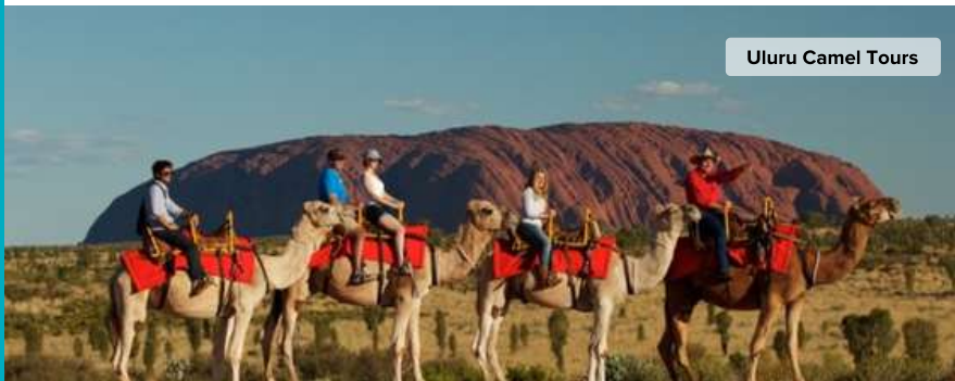
Uluru Camel Tours

Complete your day at Uluru by watching the sunset from one of the two designated viewing areas. At this time of the afternoon, a different range of colours will intensify and then fade with the falling sun. By now, you'll be feeling well and truly seduced by the incredible atmosphere of this vast desert park.