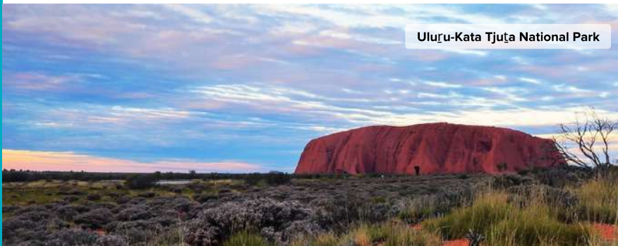
Uluru-Kata Tjuta National Park

Return to the Red Centre Way and spend the morning driving 321 kilometres south to Uluru-Kata Tjuta National Park. Check in to Ayers Rock Resort, which offers everything from campsites and serviced apartments to luxury accommodation at Sails in the Desert and Longitude 131.