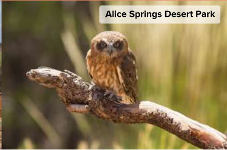
Alice Springs Desert Park

Exclusive to Avida Members receive a FREE bird photo opportunity with every admission ticket to Alice Springs Desert Park, where the desert comes alive! Simply print out the voucher below and present to the park upon entry. Presenting your Avida ID at entry is also acceptable to redeem this offer. This offer is valid until 31st March 2022.