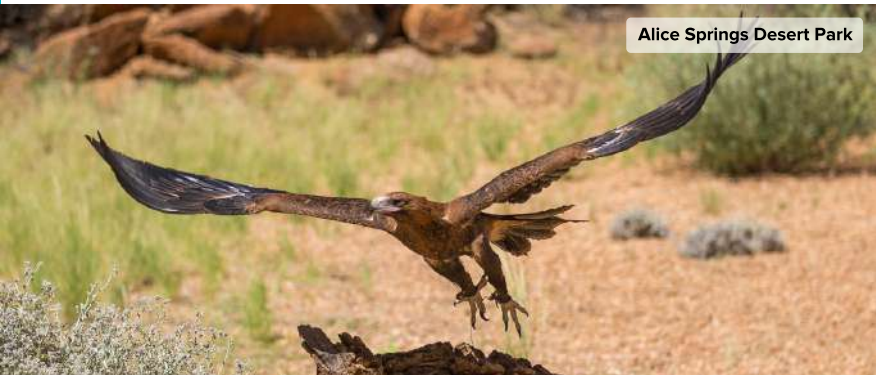
Alice Springs Desert Park

Alice Springs Desert Park - Larapinta Dr, Alice Springs NT 0870