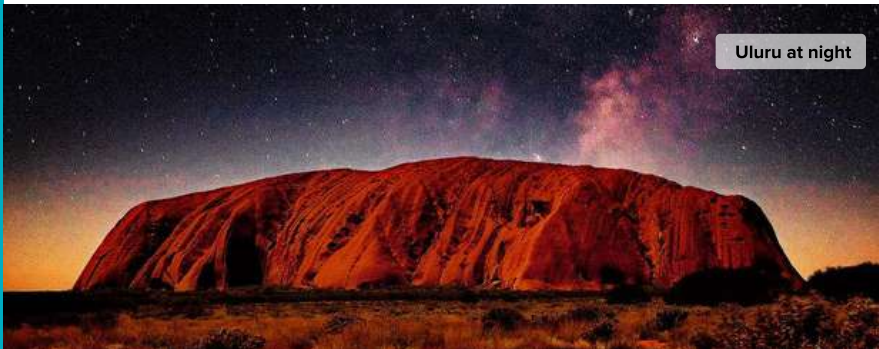
Uluru at night

Complete your day at Uluru by watching the sunset from one of the two designated viewing areas. At this time of the afternoon, a different range of colours will intensify and then fade with the falling sun. By now, you'll be feeling well and truly seduced by the incredible atmosphere of this vast desert park.