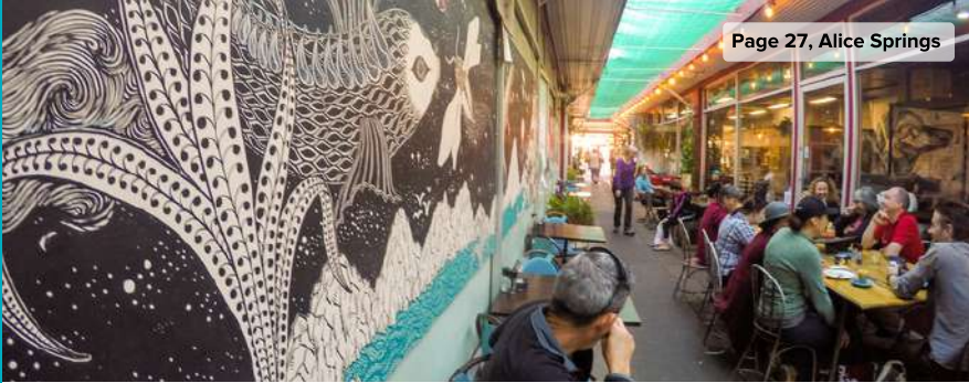
Page 27, Alice Springs

Before heading deeper into the desert, indulge in a hearty breakfast at one of Alice's best casual eateries, Page 27. It's a delightful, bustling café much loved by the town's creative crowd. Afterwards, gaze upon bright, bold and modern Aboriginal art at Papunya Tula Artists and Mbantua Gallery, both in the car-free Todd Mall precinct, before getting into your hire car (you'll need a 4WD for a later section of this trip).