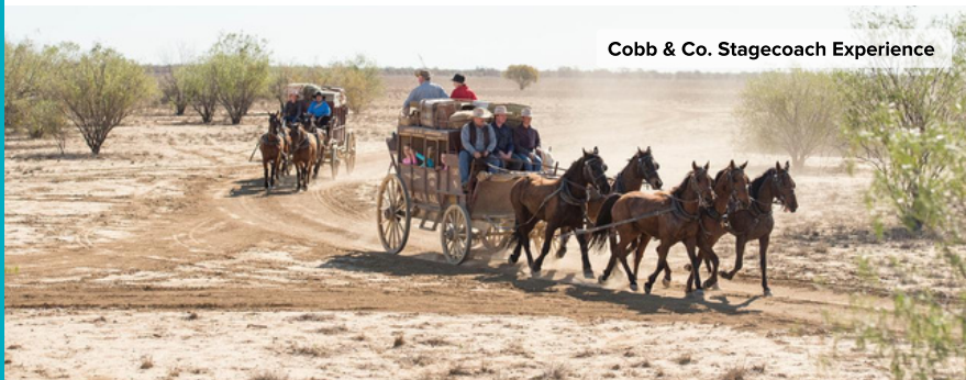
Cobb & Co. Stagecoach Experience

You know you're in the heart of the outback when you've arrived in Longreach. There's so much to do here, but even more to discover about Australia's rich history and unique character. Visit the Australian Stockman's Hall of Fame, the Cobb & Co. Stagecoach Experience and the Qantas Founders Museum.