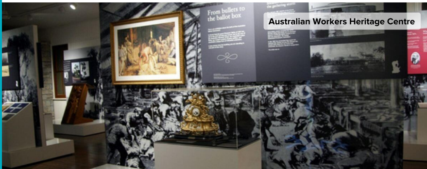
Australian Workers Heritage Centre

Before arriving in Longreach, make a pitstop in Barcardine. Here, you can visit the Australian Workers Heritage Centre that celebrates working Australians.